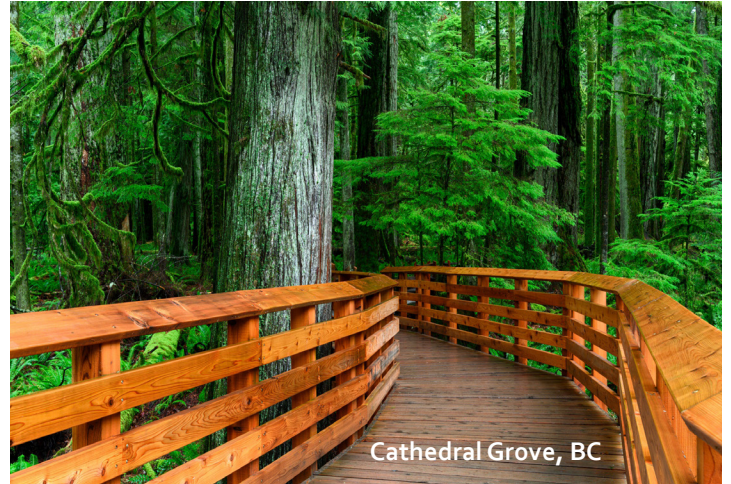
Cathedral Grove, BC