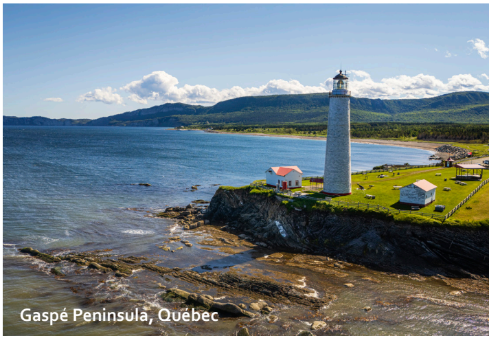
Gaspé Peninsula, Québec