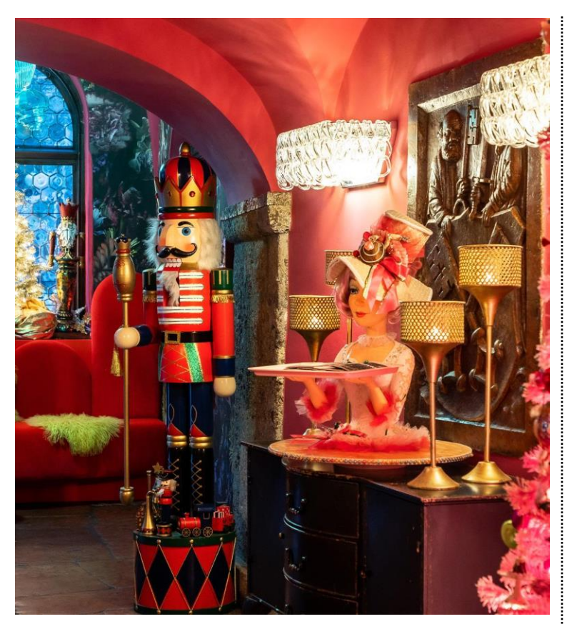
8 Days • 10 Meals: 6 Breakfasts, 1 Lunch, 3 Dinners

HIGHLIGHTS... Innsbruck, Choice on Tour: Innsbruck City Tour or Museum of Tyrolean Heritage, Seefeld, Carriage Ride, Salzburg, St. Peter's Restaurant, Oberammergau, Munich, Christmas Markets